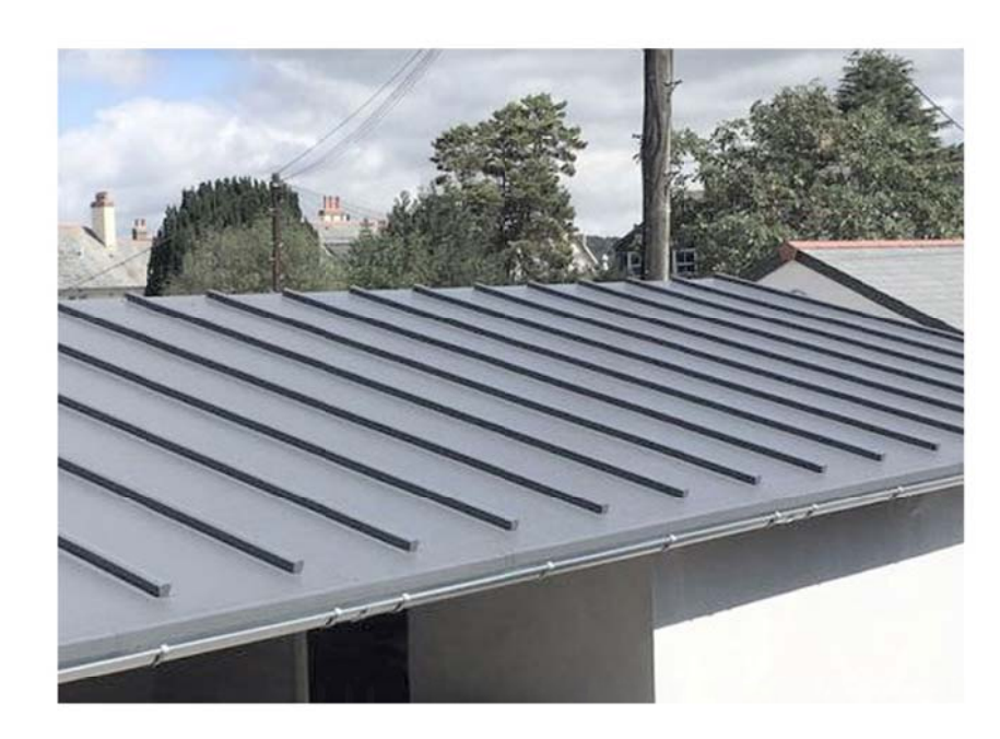
BATTEN ROLL SINGLE PLY ROOF