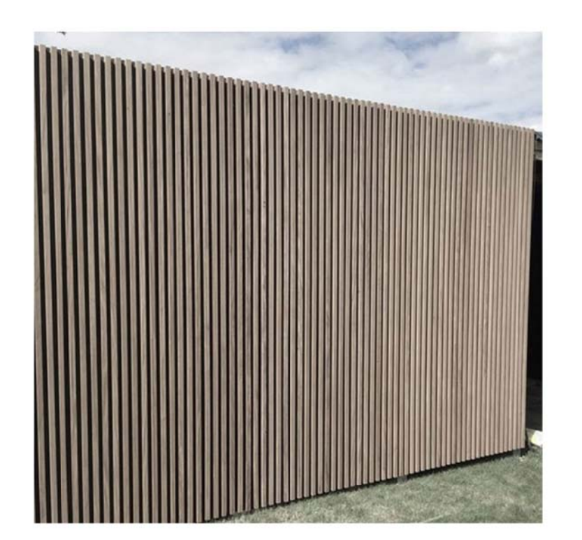
TIMBER SLAT FENCE & GATE