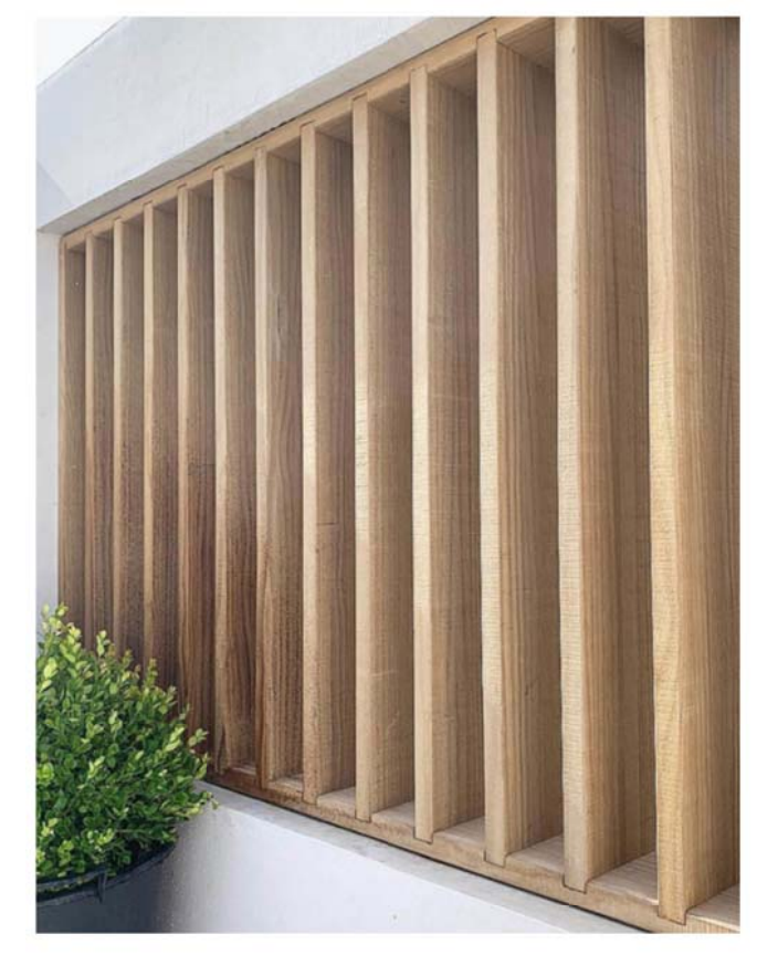
TIMBER FRAME AND FINS TO CLERESTORY WINDOW