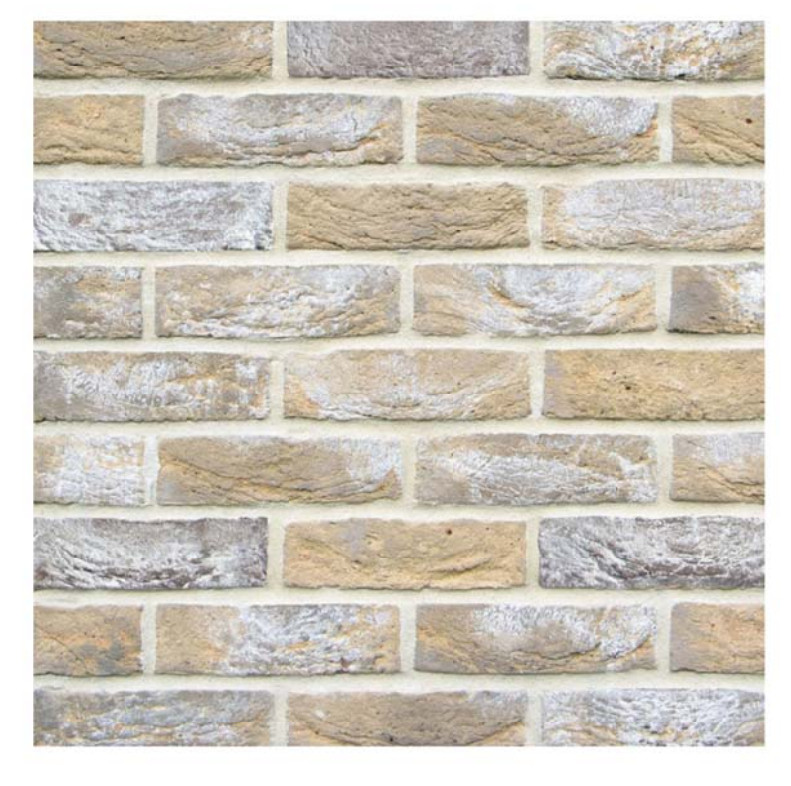
LONDON STOCK / BUFF-GREY BRICKWORK